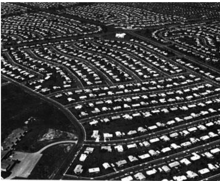
Figure 2 Levittown, New Jersey

But dealing with taxes, duties and labor productivity are middle-income country issues. The fact is that it is very difficult to build affordable permanent housing in low-income countries.